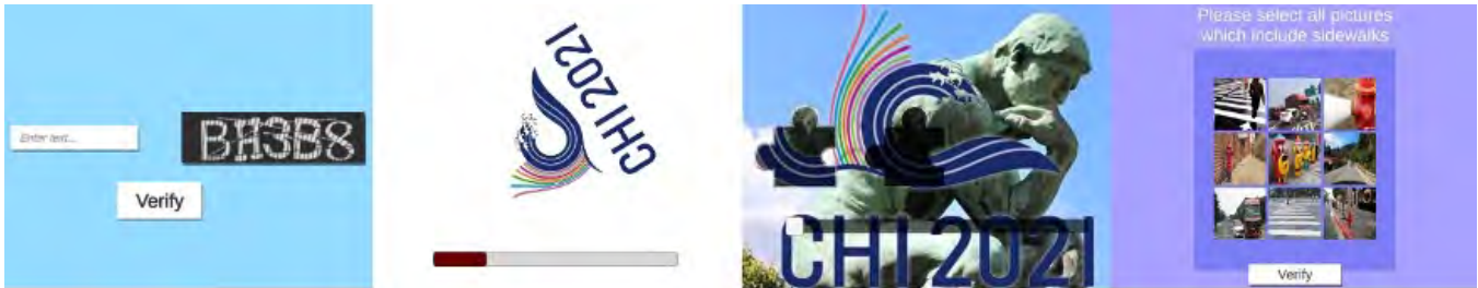
Figure 1: Four traditional CAPTCHAs: (1) Text-based CAPTCHA; (2) Image-rotated CAPTCHA; (3) Image-puzzled CAPTCHA; and (4) Image-selected CAPTCHA.

to make OCR more difficult so that the bots cannot recognize the texts. For example, Baird et al. [2] proposed ScatterType CAPTCHA, which prevents the computer from splitting characters from a word. However, the feasibility of text-input CAPTCHA in VR environments has not been fully discussed. Based on previous research on inputting text in VR [19], it may be a misconception to still opt for text-based CAPTCHAs in VR.