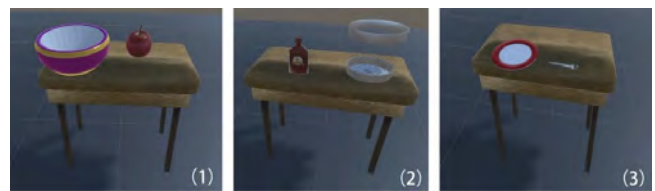
Figure 2: Take-driven CAPTCHA.

3.2.1 Task-driven CAPTCHA. We first designed a CAPTCHA that requires the user to perform a simple action to authenticate. This CAPTCHA requires the user to lift a virtual object (e.g., apple, wine bottle or silver knife and fork) by holding the trigger button and moving it to a specified location (e.g., purple bowl (Fig. 2.1), trash