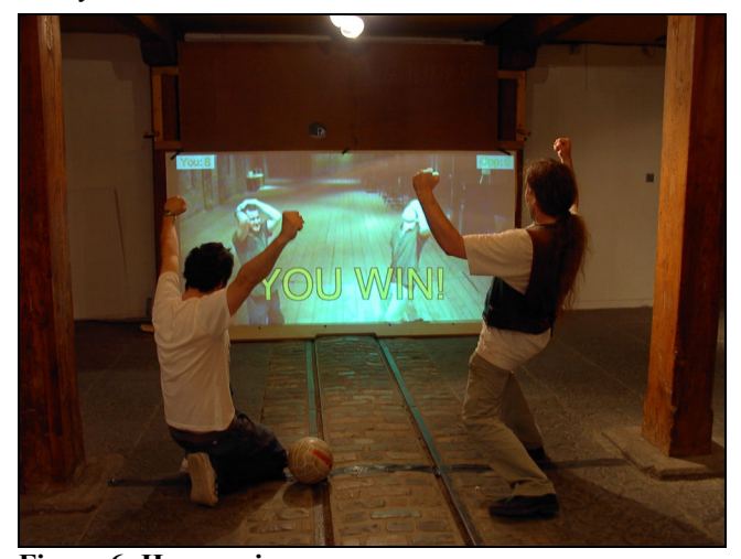
Figure 6: Happy winners

Augmenting a gaming environment with exertion will greatly enhance the potential for social bonding, just as playing an exhausting game of squash or tennis with a new acquaintance or co-worker helps to "break the ice" and build friendships. You can now have fun playing sports with your local and remote friends!