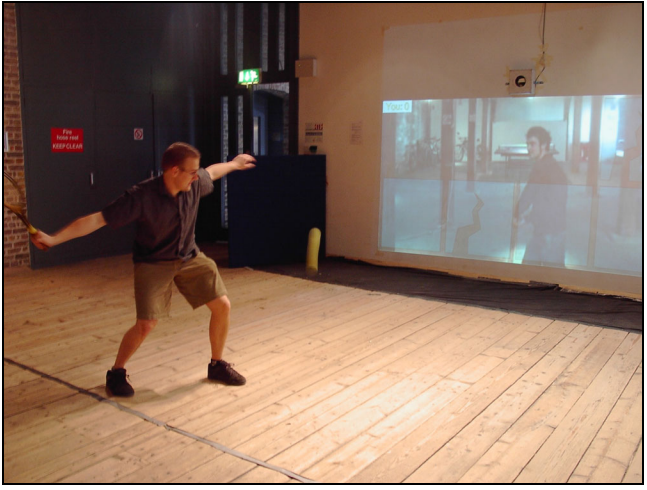
Figure 3: The system also works with tennis balls

They have to strike semi-transparent blocks, which are overlaid on the video stream. These virtual blocks are connected over the network, meaning they are shared between the locations. If, for example, one player hits the block on the upper left, the block on the upper right is hit for the other player. The goal is to hit all the blocks before the other player hits them. You win if you hit more blocks than the other player.