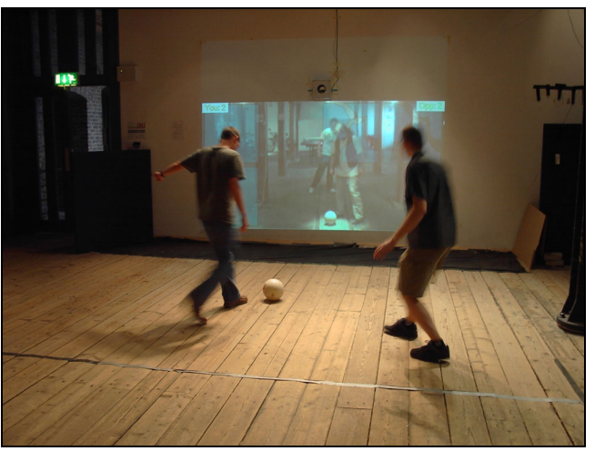
Figure 5: Breakout for Two also supports two-on-two CONCLUSION

56 volunteers evaluated the system. They did not know each other beforehand, and played Breakout for Two for half an hour. These players reported that they got to know the other player better, became better friends, felt the other player was more talkative and were happier with the transmitted audio and video quality, in comparison to those who played an analogous game using a non-exertion keyboard interface (p<0.05 for all these results) [2].