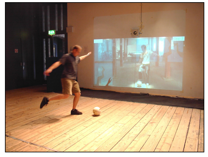
Figure 1: Breakout for Two

With breakout for Two, you can. Breakout for Two is the first prototype of a physical, exertion sport that you can play over a distance.