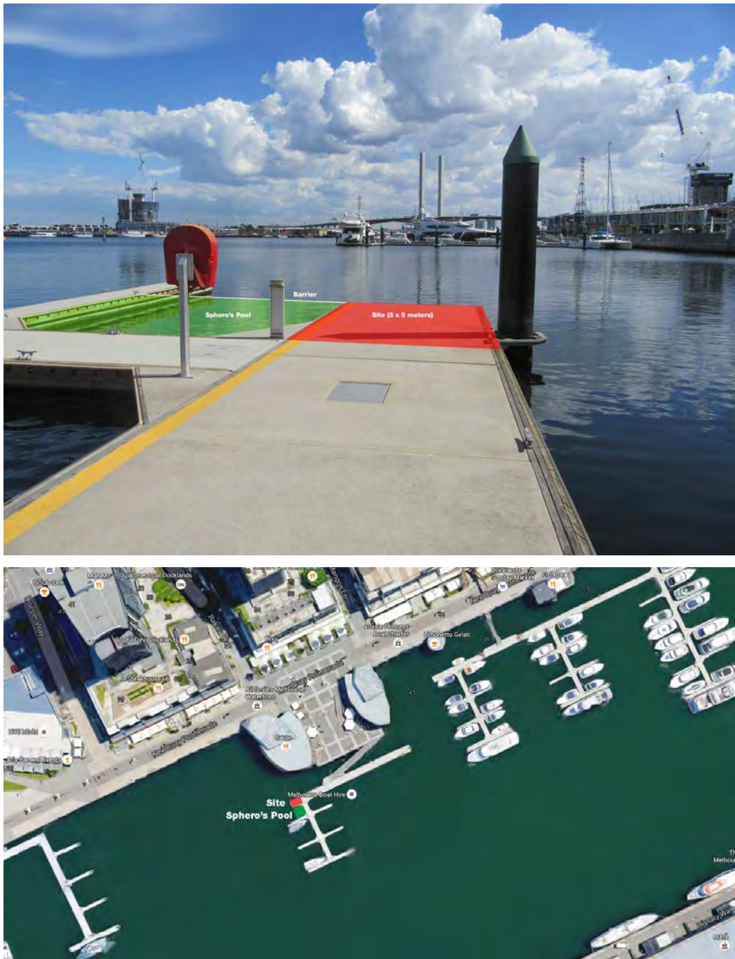
Figure 6: The site at the end of the west berth pontoon on New Quay, Docklands.