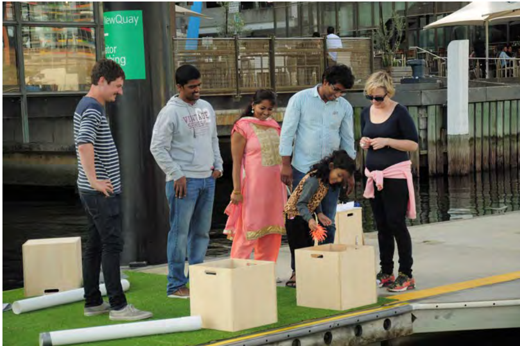
Figure 9: Child interacting with water robot skin in water crate (Source: Authors).