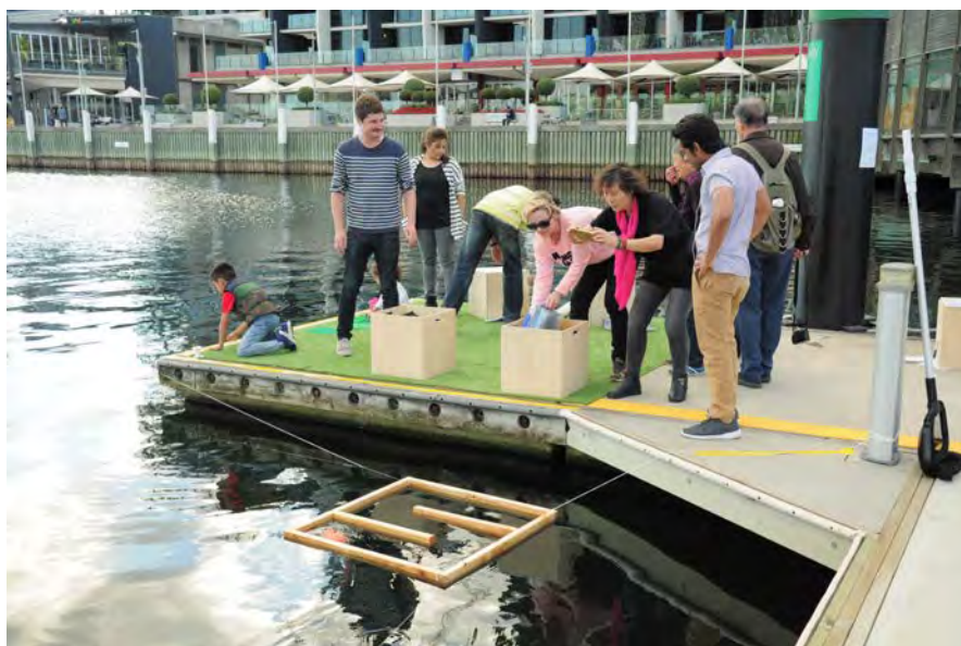
Figure 11: Installation overview.

The artificial turf laid onto the surface of the pontoon was another element that seems to have afforded playful uses. Several children were observed sitting on the turf and playing with the plastic brick diorama. A boy ran towards the diorama and slid on his knees to reach it – an act that would have been very painful on the bare concrete surface of the pontoon. Other practices include kneeling or lying on the turf to see into the water, both with and without the water telescope. This practice is also possible on concrete, but is more pleasant on a soft artificial turf. The several un-programmed crates provided as informal, moveable seating were also rearranged by participants to support their activities - for example by placing them in front of the water robot for a more comfortable interaction.