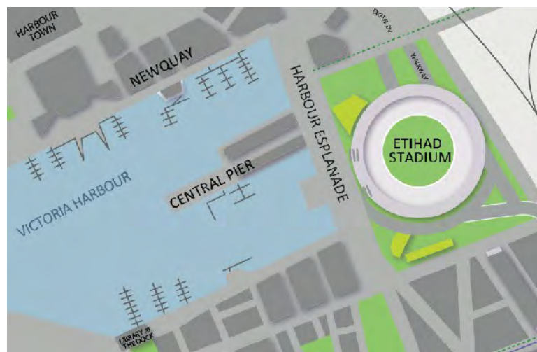
Figure 3: Map of Melbourne Docklands.

Analysis conducted through studies of maps and on-site observations revealed that the Docklands promenades are separated from the water by a series of different boundaries. Several of these boundaries are formed by berthing pontoons used for mooring sailboats. As these berthing areas are organized through private clubs, most of them are sealed off from the public, resulting in very limited public access to the water. Our count found that over eighty percent of the more than 200 berthing points in the Harbour are sealed off, only accessible with a membership card. Other boundaries are formed by pavilions placed on the edge of the promenade, blocking views and access to water, which was evident at street level along the promenade and along adjacent streets leading to the promenade. These pavilions are used by upmarket restaurants, which increase social stratification on the water edge.