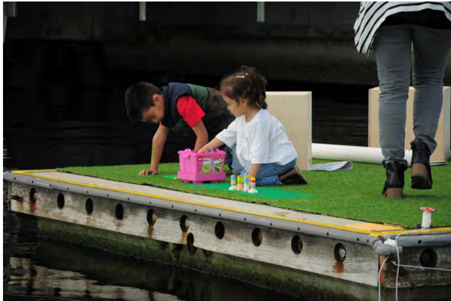
Figure 10: Children using the plastic brick diorama.

The artificial turf laid onto the surface of the pontoon was another element that seems to have afforded playful uses. Several children were observed sitting on the turf and playing with the plastic brick diorama. A boy ran towards the diorama and slid on his knees to reach it – an act that would have been very painful on the bare concrete surface of the pontoon. Other practices include kneeling or lying on the turf to see into the water, both with and without the water telescope. This practice is also possible on concrete, but is more pleasant on a soft artificial turf. The several un-programmed crates provided as informal, moveable seating were also rearranged by participants to support their activities - for example by placing them in front of the water robot for a more comfortable interaction.