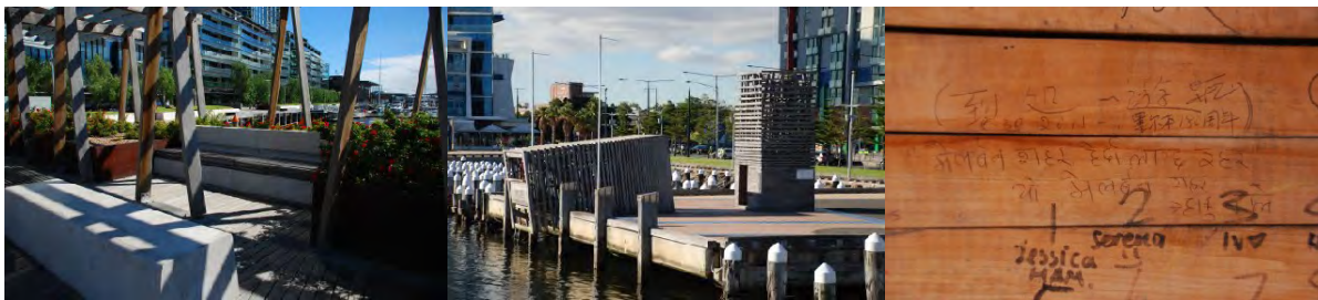
Figure 2: Intimate space on Victoria Harbour Promenade, and wooden structure on Harbour Esplanade (Source: Authors).

users in Docklands, and recommendations for its urban spaces to afford more human interaction, as discussed above. Several notes that people have left here express discontent with the area - the space functions as a forum for public debate of the city. The space thus provides a possibility for expressing feelings about the Docklands, a precinct which was also criticized for a lack of public involvement in its construction phases. This space deviates from the general critique of the area as lacking social identity and sense of place (Douglas & Monacella, 2012). Such spaces can also be perceived as having a potential for nurturing urban diversity in the fringes and interstices of formal urban spaces (Stevens & Dovey, 2004).