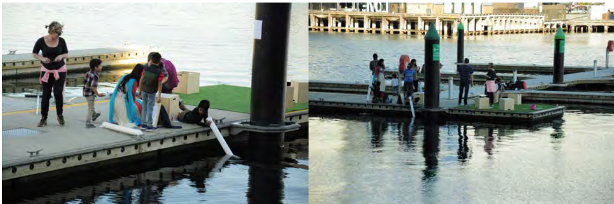
Figure 7: Participants using water telescopes and periscopes alone and in groups.

'I just want to look down and see how it looks, because I have been to Cairns [in tropical northern Australia], where I did a scuba dive and saw a different world altogether. You can see the mullets, different fish and plants – it's a different world altogether. Above the surface we can't see that...' (Man, 30 years old, living in Docklands for 4 years).