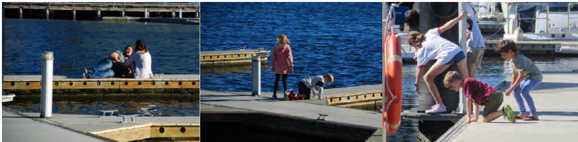
Figure 4: Users appropriating berth pontoons and showing interest in its marine life (Source: Authors).

The water access at Docklands is therefore delimited in various ways, even though recent planning documents for the area note that water should be an essential feature of its public space designs (Hassell Ltd., 2015:28). Because the Docklands area has poor connections to the waterfront, Gehl (2010) has recommended designing ways of getting closer to the water and supporting a wider spectrum of water activities. Figure 4 shows an example of users' desires to get close to Docklands' water and study its marine life.