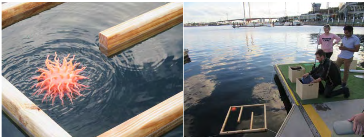
Figure 8: The water robot in its custom-built course. To the right, a young man is controlling the water robot through a floating box with a tablet controller inside, which he cannot see.

Practice was necessary to steer the water robot through the course, and it would usually take participants several tilts to each side and several unintended detours before they developed adequate control of the water robot. After they had gained control, they generally showed more satisfaction and enjoyment in the experience. One participant reacted by shouting