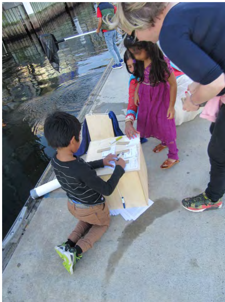
Figure 12: Children gather around feedback crate to draw.

The researchers had not predicted the observed activity of participants drawing directly onto the side of the feedback crate. This crate was presented as a table where survey sheets could be filled out on top when sitting or crouching. If participants has been able to spend more time at the site, we imagine that more participants might have been aware of opportunities for drawing on the box itself, as we had observed in site analysis of the larger existing wooden enclosure on the other side of the harbor.