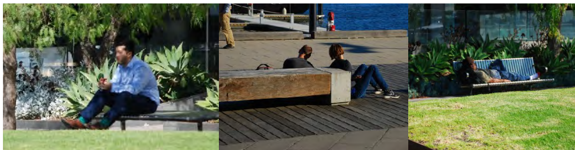
Figure 1: Users appropriating benches in Docklands (Source: Authors).

The design of public spaces in Docklands was explored in terms of the relation between users' desires and spatial affordances (Stevens & Dovey, 2004). The analyses showed that the public spaces along the quays in Docklands are appropriated in different ways, which reveal diverse understandings, readings and desires. One example is the use of the benches in the waterfront public spaces, and how these are appropriated in multiple ways, including ways they were not designed for (Whyte, 1988). The following examples illustrate the complexity in the uses of these spaces. As a bench was orientated away from water, a man was observed turning around to face the water using a curb as footrest. Another bench lacked a backrest, resulting in a couple sitting on the ground, using the bench as backrest, instead of sitting on the bench seat. Some street furnishings in Docklands comfortably afforded sleeping; others were not comfortable to sleep on but were used for this purpose anyway.