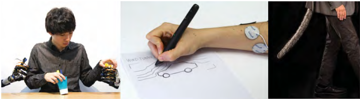
Figure 1. Exemplars of Human-Computer Integration: extending the body with additional robotic arms; [71] embedding computation into the body using electric muscle stimulation to manipulate handwriting [49]; and, a tail extension controlled by body movements [87].