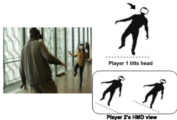
Figure 1: Left - AR Fighter. Right – as player 1 tilts head, player 2’s HMD exaggerates how much player 1 is leaning.

ACM ISBN 978-1-4503-5624-4/18/10...$15.00 https://doi.org/10.1145/3242671.3242689