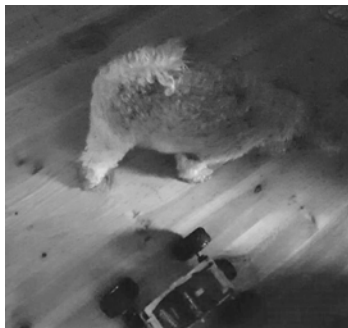
Figure 2 Local Playtest 2 -Car Disinterest