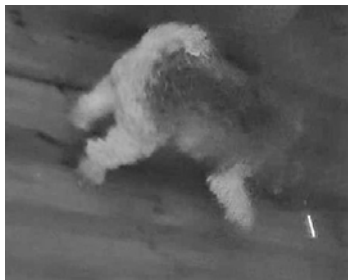
Figure 3 Local Playtest 3 - Full Laser Focus