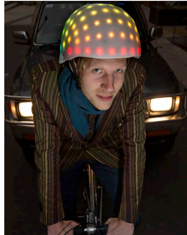
Figure 1. LumaHelm.

Previous research has explored various ways in which wearable interactive technology can augment physical activity, for example see the many mobile phone sports apps. We noticed that there is little work on helmet-based concepts, and if so, they focus on the interaction between the helmet and the wearer [5, 8]. In response, we developed a helmet where the interaction is also oriented outward, and covered an existing bicycle helmet with a total of 104 individually addressable RGB LEDs. The LEDs are controlled by an Arduino Uno board. Because the memory and processing power of the Arduino is limited, and to simplify the control of our system, we developed a library in Processing allowing us to instantly map what we draw on a computer screen to the lights on the helmet. This setup allows anyone with minimal programming experience to create rich visuals with our helmet, and control them through any sensors that can interface with the Arduino or any computer.