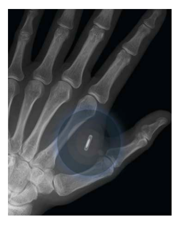
Figure 2. NFC implants show up on an X-ray.