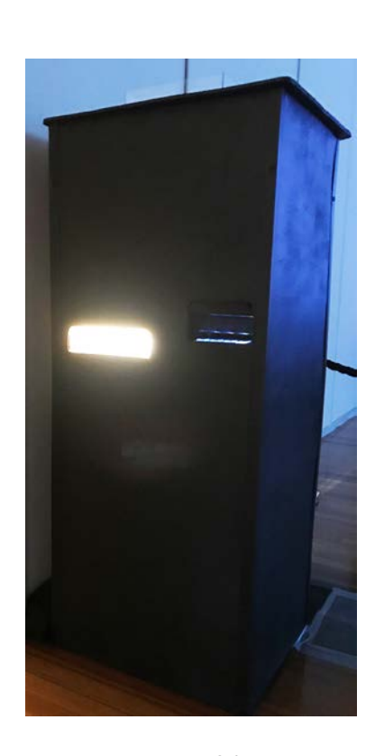
Figure 6. Version 2 of the Storytelling Machine's photo booth. Audiences placed a hand drawn character into this booth and at the press of the button the drawing was digitalised, animated and placed into one of the installation's video settings.

The Storytelling Machine Drawing Templates During exhibitions and workshops, we provided audiences with a choice of four drawing templates (figure 7). These templates provided a starting point or inspiration for a person's character. Audiences could draw an image of any shape and size within the boundaries set on the paper templates.