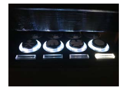
Figure 5 The four buttons in The Storytelling Machine's photo booth. Each button corresponds with one of the paper templates.

Audiences were invited to not only contribute to a collective story but to consider the impact that automated systems are having on contemporary storytelling. Once they entered their character into the machine, audiences relinquished control over their character. The machine animated each character using a random selection of pre-programmed commands. The machine stored all of the drawings and texts that were entered by the public over time; the more this work was exhibited the bigger the collective story became. The machine curated and randomly controlled the narrative. The collective story did not have a beginning, middle and end; it was a post-modern fragmented set of story vignettes. The machine controlled the narrative.