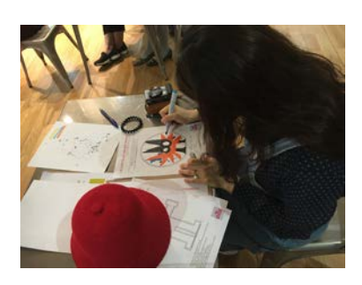
Figure 3 An audience member drawing a character that was later entered into The Storytelling Machine. Stories were entered into the machine via a custom-made photo booth.

research and design work helps us understand the complex relationship between games and storytelling and how these elements can be present in both competitive and non-competitive play environments. The Storytelling Machine offers a non-competitive environment where audiences are invited to play with the structure and content of an interactive digital story.