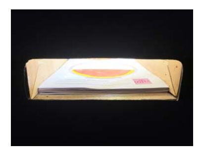
Figure 4. A hand-drawn image in The Storytelling Machine's photo booth. ©PluqinHUMAN