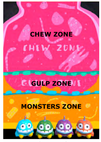
Figure 4 The game's content is divided into three zones, namely, the chew zone, the gulp zone and the monsters zone.

"Hungry Panda" [12]. Studies suggest that games are effective in changing health-related behaviors [4, 20] and can promote behavioral changes by enhancing motivation [4]. We note that the aforementioned games concentrate predominantly on the nutritional aspect of food, specifically on what we should eat, rather than how we should eat. However, by considering a holistic view of nutrition and health, we find that how we eat is also of importance and chewing is one of the key determinants of how we eat. This inspired us to go down this under-explored path to design our game to engage people in the practice of proper chewing.