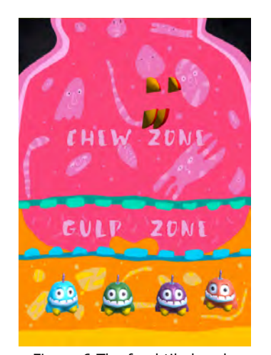
Figure 6 The food tile breaks into pieces as the person continues to chew the food item.

The time for which a person can chew is dependent on the speed at which the tile breaks and moves in the chew zone. This speed varies with the food item being eaten, for example, a banana tile falls faster than a carrot tile because it takes more time to chew a real piece of a carrot than a banana.