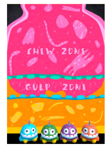
Figure 8 The monsters eat the food tiles and bulge in size.