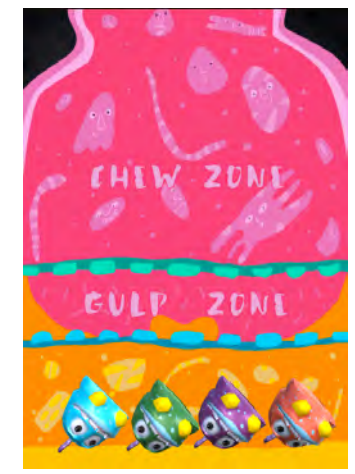
Figure 9 An animation of the angry monsters when the player does not chew the food properly.