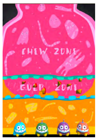
Figure 7 When the food tile reaches the gulp zone, the co-player instructs the player to gulp the real food.