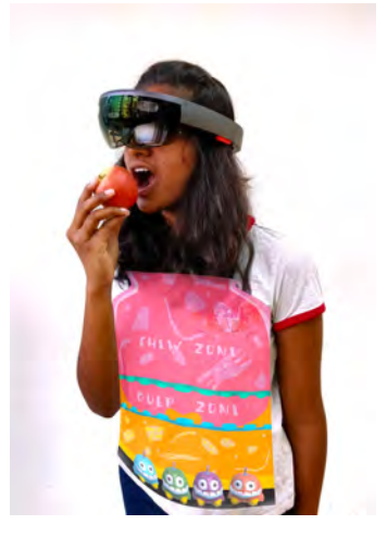
Figure 3 The game's content is overlaid on the player's torso.