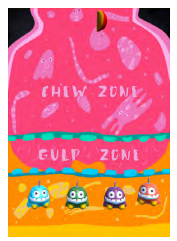
Figure 5 A food tile is generated on the content overlaid on the co-players when the players put the food item in their mouth.