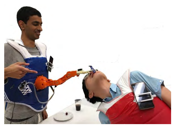
Figure 6. Participants experiencing playful social eating

Participants noted that they were aware of the fact that even though the arm was being controlled by their partner's facial expressions, they did not lose total control over their arm. For example, Participant 10 said: "Having the robotic arm on my body means I still have some sort of control over it. For example, I can at least decide what food to pick".