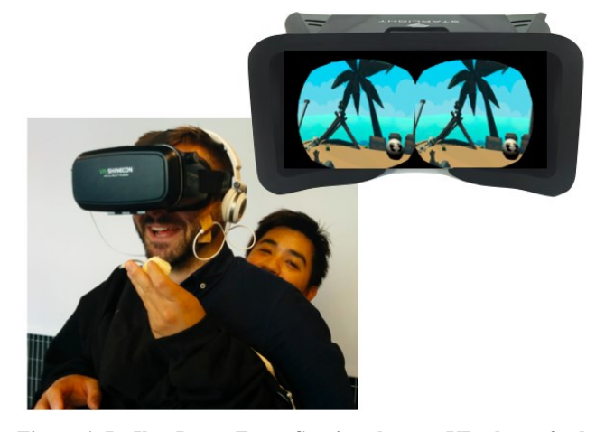
Figure 1. In You Better Eat to Survive , the non-VR player feeds the VR player from behind to survive on a virtual island

In this work we investigate the use of a gustatory interface, in particular the chewing of food, to control actions in VR games. Eating can offer a rich multisensory social experience [24] that so far has rarely been used in a VR gaming context. Our work also aims to address the feeling of social disconnect in VR environments through cooperative eating, which could add excitement [50] and the feeling of social presence [3] to the VR experience. Drawing on this, we designed and studied You Better Eat to Survive , a two-player VR game in which a player has to chew real food (fed by the other player) to survive and ultimately escape from a virtual island (see Figure 1). We detect chewing by analyzing the chewing sounds captured by a low-cost microphone attached to the player's cheek.