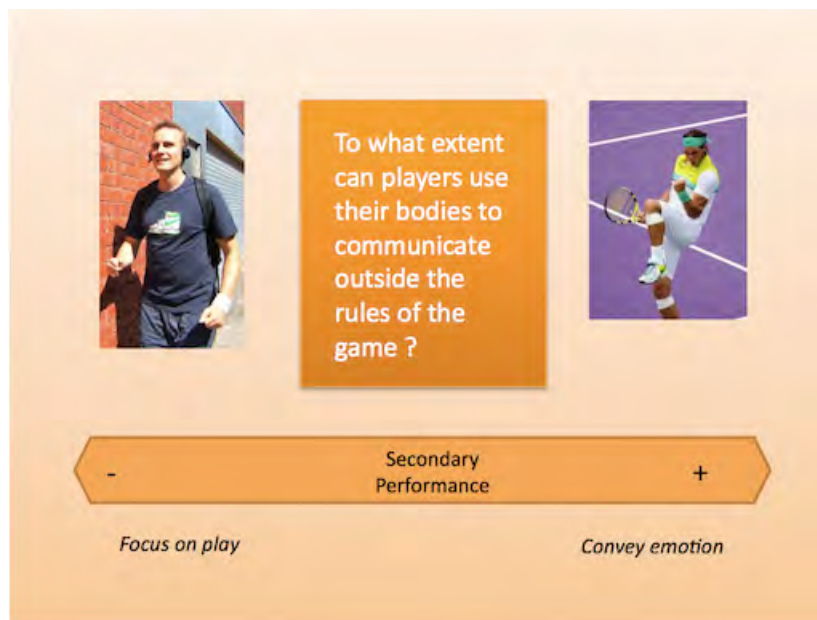
Figure 4.2: One of the exertion game cards.

Risk of exertion highlights the vulnerability of the body to overexertion and injury. However, exposure of the body to risk in sport is different to risk-taking in computer games [Salen and Zimmerman, 2003b]. In computer games, risk is virtual, as most actions can be “undone” easily [Klemmer and Hartmann, 2006]. In contrast, bodily vulnerability can lead to a constant preparedness for danger and surprise, and this readiness shapes one’s life experience [Dreyfus, 1991].