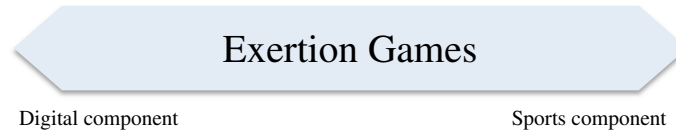
Figure 3.1: Exertion games lie on a spectrum that has an either digital or sports component.

incorporate digital play, and then there are examples that sit somewhere in between. Our aim is to highlight a range of examples across the spectrum in order to demonstrate the breadth of the field. As such, we have included examples we believe exemplify and stand for a certain class of exertion games that made a significant contribution to the field. Consequently, we do not provide a complete list of games nor is our approach unbiased; on the contrary our approach represents a personal perspective on the field.