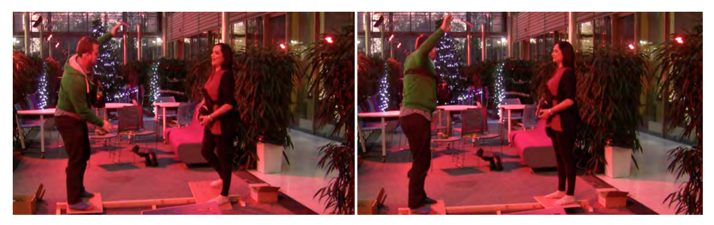
Figure 5. Player 2 (right) loses the first round, and concentrates on their breathing technique to remain balanced in the next round.

A concern of ours when we decided to use GVS to affect player balance in a digital vertigo game was that players could have found the effect uncomfortable, and, due to the disorientating nature of the game, unpleasant. However, in our game this did not appear to be the case and participants enjoyed playing. Participants offered suggestions for future games, such as a GVS controlled vertigo horror game: "in a horror game, if you got that feeling at a crucial moment, that would make it a lot more fun, and, like, seem more real", suggesting that they would be eager to not only play Balance Ninja again, but future digital vertigo games. We also observed a sense of playful engagement emerging between players with participants regularly laughing when they lost and joking with each other at the attempts of another player to cause them to lose their balance. None of the participants wished to stop playing during the study and, as the questionnaire responses suggest, 90% of the participants would play the game again, with the remaining 10% neutral about replaying.