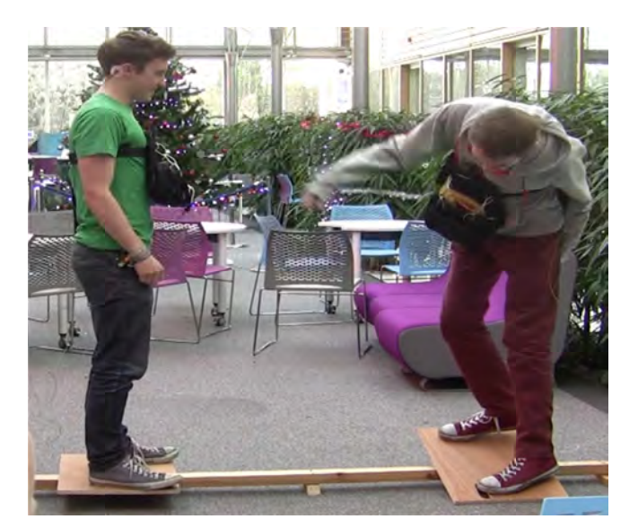
Figure 3. Player 1 (left) smiles as he wins the round when player 2 touches his balance board to the floor.

The object of the game is to cause the opposing player to lose their balance and either step off their board, or touch their