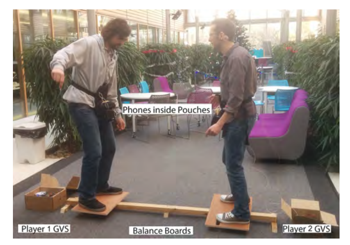
Figure 1. Balance Ninja.

DOI: http://dx.doi.org/10.1145/2967934.2968080