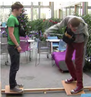
Figure 2: Balance Ninja