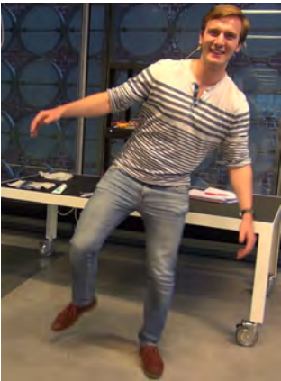
Figure 1: Inner Disturbance