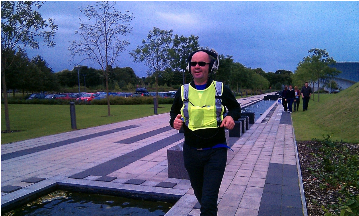
Figure 4. I Seek the Nerves Under Your Skin

environments (Marshall et al., 2011a). Whilst the underlying exercise here is essentially the same as doing sprint interval training, even regular runners who were experienced with that kind of training reported finding it hard when attempting to hear a poem at the same time. The largely unexplained nature of the system led participants decide for themselves whether to interpret the system as a game which was challenging them to run fast enough to beat the system, or as a more open ended form of play around how the sounds produced respond to movement (Marshall et al., 2011a).