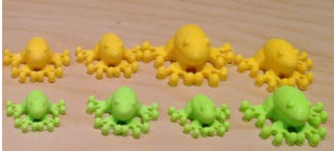
Figure 5: Participants liked the frog and the way it scales with their physical activity. It also became the object for public display and reflective conversations.