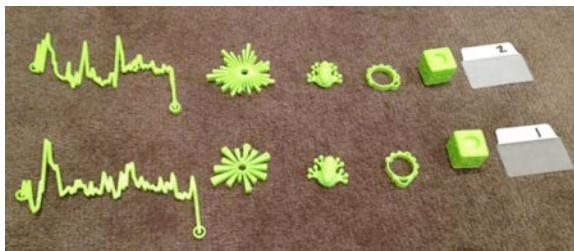
Figure 4: Participants were enthusiastic to see how their reflected heart rate evolved in different material forms as the study progressed. Participants arranged their objects according to day and used sticky notes for assigning days.

All the participants were enthusiastic about seeing their heart rate reflected in material artifacts despite the lengthy process of printing all five objects every day (Figure 4).