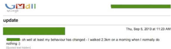
Figure 7: Engagement with the artifacts encouraged a participant to go for a walk.