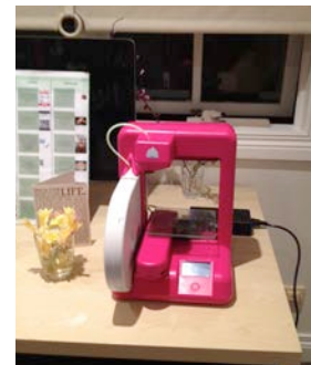
Figure 3: Participants tried to make the printer fit into their home ambience.

Participants usually placed the 3D printer in their living room space close to a window to nullify potential print smell, as seen in Figure 3.