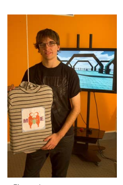
Figure 1. Pillow controller with screen displaying virtual world containing sound sources

entertainment experiences. Social awkwardness, on the other hand, is often considered a negative experience that can involve stress and lead to mental and physical suffering due to fear and anxiety [1]. Interestingly, Benford et al. propose that uncomfortable interactions, such as facilitated by social awkwardness, can work to enhance the entertainment experience as opposed to diminishing it [1]. This notion stems back to humans' fundamental need for stimulation, arousal and excitement and is common where feelings of thrill may arise from a combination of fearful anticipation, followed by an extreme physical sensation, and then euphoria of relief at having survived [1]. Examples where these types of experiences are fostered are extreme sports and theme park roller coasters.