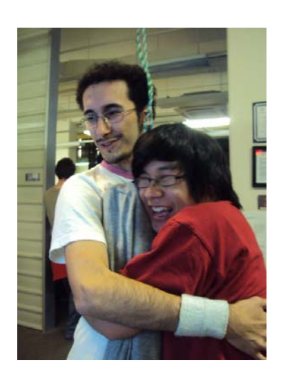
Figure 3. Two players accepting and enjoying the awkward nature of the game